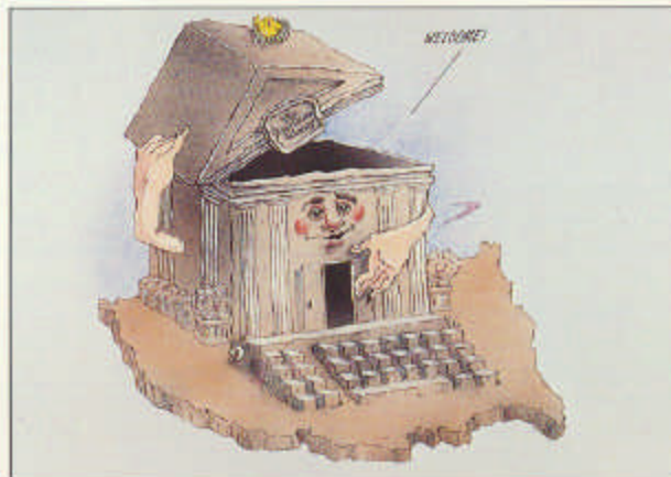
An ever-expanding library of business software.

A good library should provide an environment that is conducive to relaxed, productive work. This is the philosophy that guided the overall design of the Business Library. All features have been arranged for easy access and use. All the programs are menu-driven; allowing the operator to move quickly from task to task. All tasks are initiated with standard function keys, and are guided by clear prompts. An extensive set of error messages identifies data-entry and system-operation mistakes and directs the operator in making corrections. An optional, self-instructional videotape training program introduces the operator to each module. A complete, fast-reference operator's guide for each module extends additional, ongoing