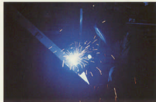
Divergent businesses can use The Business Library.

assistance as needed. If you already have, or are planning to install an IBM PC or XT, or other similar system, you will not find a more friendly atmosphere than the one offered by this library of thoughtfully designed programs.