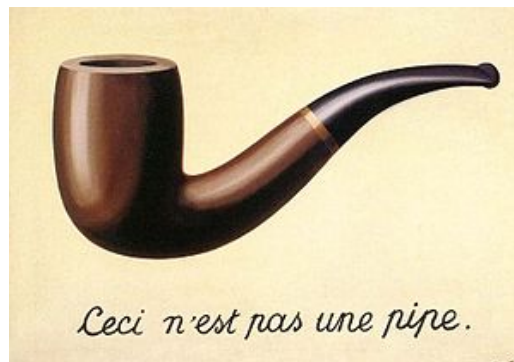
The Treachery of Images (French: La Trahison des images ), by René Magritte (1929). Also known as This is Not a Pipe .