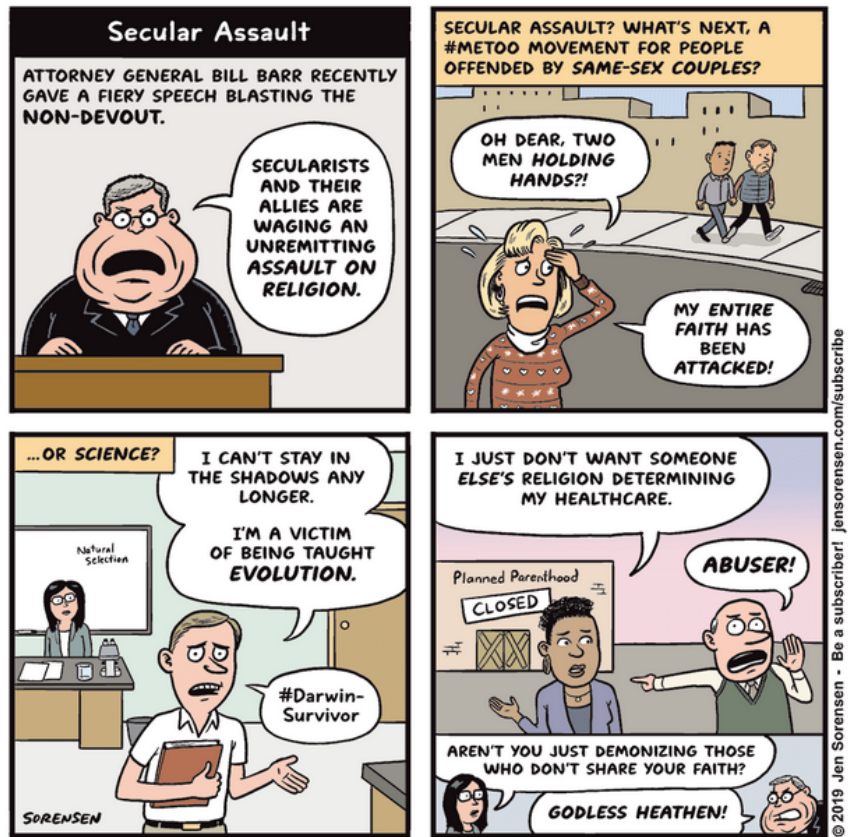
© 2019 Jen Sorensen - Be a subscriber! jensorensen.com/subscribe